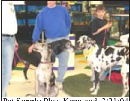
Pet Supply Plus, Kenwood, 3/21/04