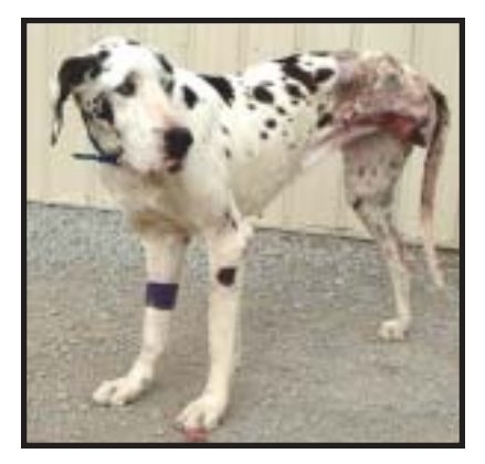
Bebe after surgery

To read Bebe's full story and see more pictures visit our web site at www.hhdane.com.