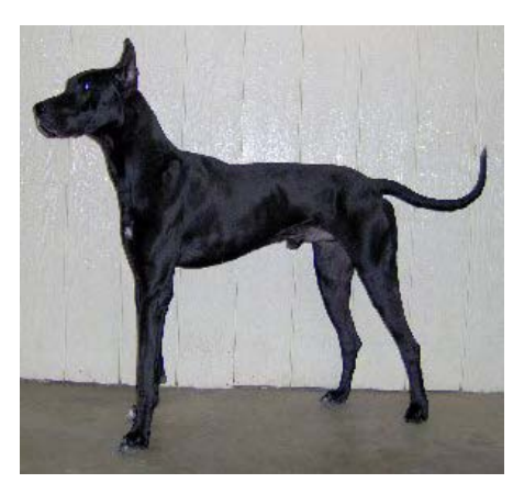
EDDY is a homeless Great Dane found wandering the streets of Columbus.