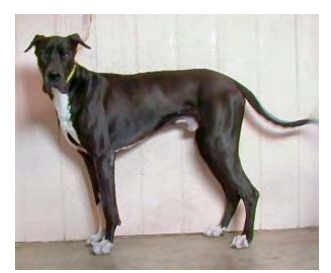
MARTIN is a homeless Great Dane that loves butterflies. He would love to chase them with you.