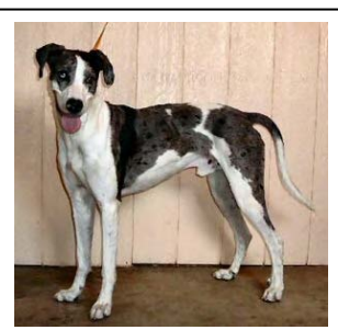
SNEAK is a homeless Dane-Catahoula mix.