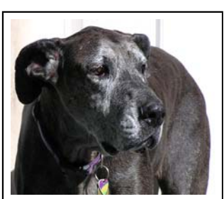
Success Story: NIKKI was adopted last summer after living at the Rescue for four years. She continues to do very well in her new forever home with 4 other dogs and 5