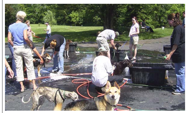
HHGDR volunteer dog washers (in black T-shirts) and Bark Park members come clean at our fundraising event in June.

Volunteers and their dogs promoted HHGDR, adoption, education against puppy mills and for spay/neuter at