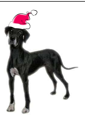
REBECCA is a homeless Great Dane.