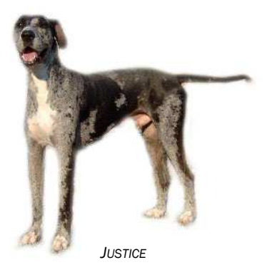
Jun. 2004-Nov. 6, 2007