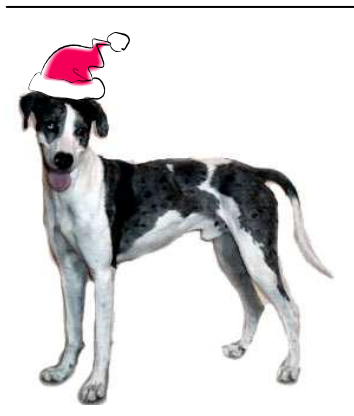
SNEAK is a homeless Great Dane-Catahoula mix.