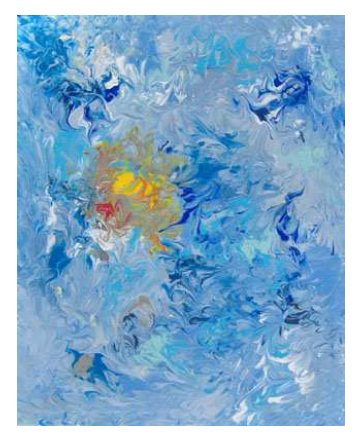
Paw-lanet, acrylic on canvas, 16 x 20". By Mozart.