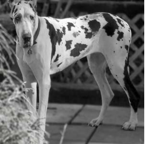
FRANNIE, an abused and happily ever after.

Current and back issues are available from the Web site and by request. http://www.hhdane.org/