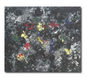
Fireflies At Mo-dnight, Acrylic on canvas, 20 x 24"