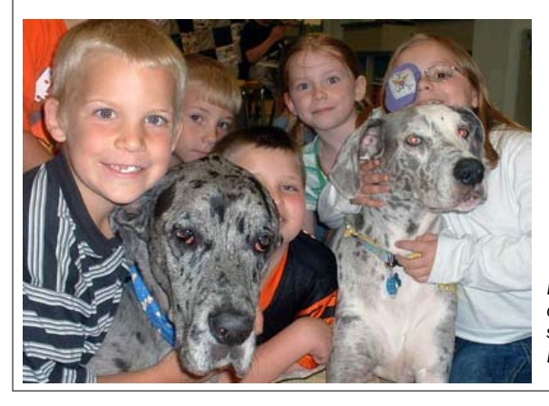
Forest Elementary School students get up close and personal with the visiting Great Danes.

Check the Web site for events in your area! http://www.hhdane.com/events/events.htm