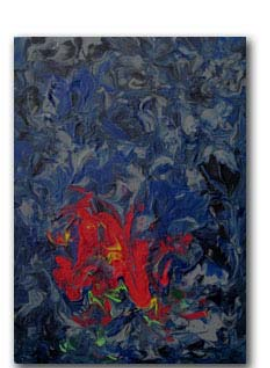
Mo's_Memories by Mo-ZART. 9 x 12", acrylic on canvas.

CHECK THE WEB SITE FOR UPCOMING HHGDR AWARENESS EVENTS IN YOUR AREA!