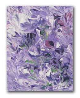
Dane-soon by Mozart. 8 x 10", acrylic on canvas.

HHGDR is a non-profit 501(c)(3) all-volunteerrun organization. Donations are taxdeductible!