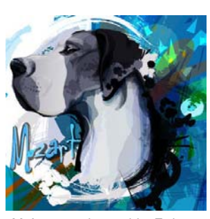
Mo's portrait on his Twitter page, designed and donated by @WaysideWaifs' graphic artist.

Mozart had a successful festival season with the aid of Rescue volunteers, and his sidekick Gracie, working art festivals in Cincinnati, Dayton, Urbana, and Yellow Springs.