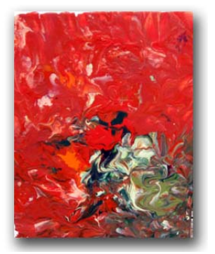
Spicey Dane by Mozart. 8 x 10", acrylic on canvas.

CHECK THE WEB SITE FOR UPCOMING HHGDR AWARENESS EVENTS IN YOUR AREA!