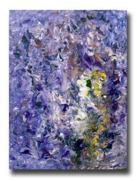
Paw Horse by MOZART. 18 x 24", acrylic on canvas

HHGDR is a non-profit 501(c)(3) all-volunteerrun organization. Donations are taxdeductible!