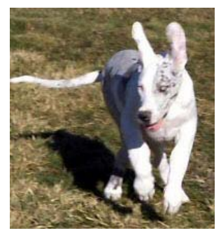
ittle girl. Sapphire says "Okay forever suddenly home where are you?"

After a couple of months of treatment, good food, and a warm bed, things were looking better for the sweet little girl. That suddenly changed in Decem-