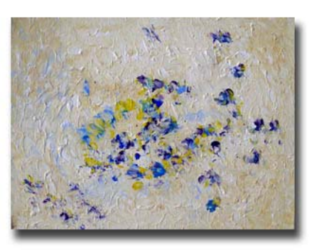
Mo-grating Butterflies by MOZART DANE. 18 x 24", acrylic on canvas.