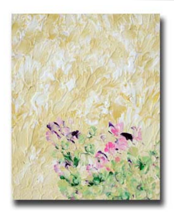
Alstroe-Mo-ria Flowers by MOZART DANE. 8 x 10", acrylic on canvas.

CHECK THE WEB SITE FOR UPCOMING AWARENESS EVENTS IN YOUR AREA!