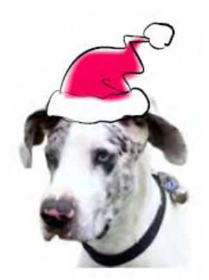
TREY had much needed surgery on his leg, thanks to donations from Rescue supporters. Now he needs a family of his own to play and cuddle with.