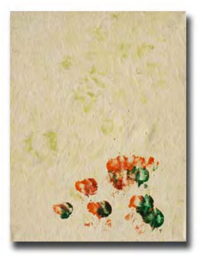
Paw-tersweet Vine by Mozart. 11 x 14", acrylic on canvas, $110.