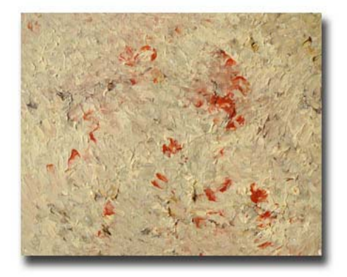
Shades of Paw-tumn by MOZART DANE. 16x20", acrylic on canvas. $175.