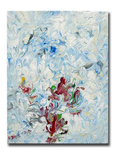
Paw-sonal by Mozart. 11 x 14", acrylic on canvas, $120.