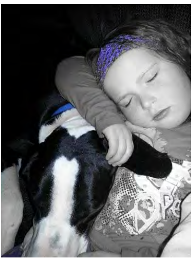
ZEKE, formerly OZORA, snuggles with his sister.

Read his story at <a href="http://hhdane.org/success/ozora.htm">http://hhdane.org/success/ozora.htm</a>.