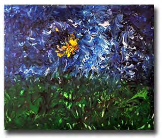
Paw-s by the Lake by Mozart. 20 x 24", acrylic on canvas, $200.

Mozart paints with his paws to help support the Rescue and provide for the homeless dogs. He is the Rescue Spokesdog against puppy mills, pet stores, and for spay/neuter.