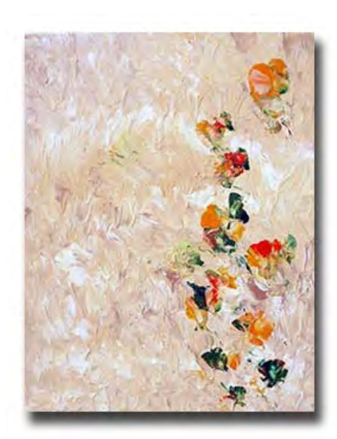
Mozart's Buttercups by Mozart. 11 x 14", acrylic on canvas, $140