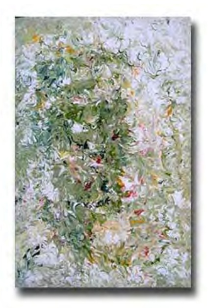
Pure Paw-ssion by Mozart. 24 x 36", acrylic on canvas, $400