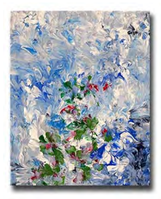
Red Hum-Mo-ngbird Vine by Mozart. 8 x 10", acrylic on canvas, $55