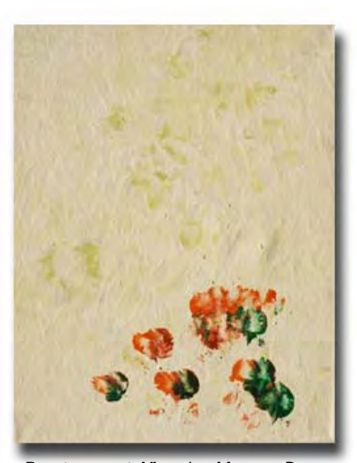
Paw-tersweet Vine by MOZART DANE. 11x14", acrylic on canvas. $110.

With holidays fast approaching, what better time than this to add a unique MOZART painting to your collection or give one as a gift to someone special. Once they are gone, there will be no more.