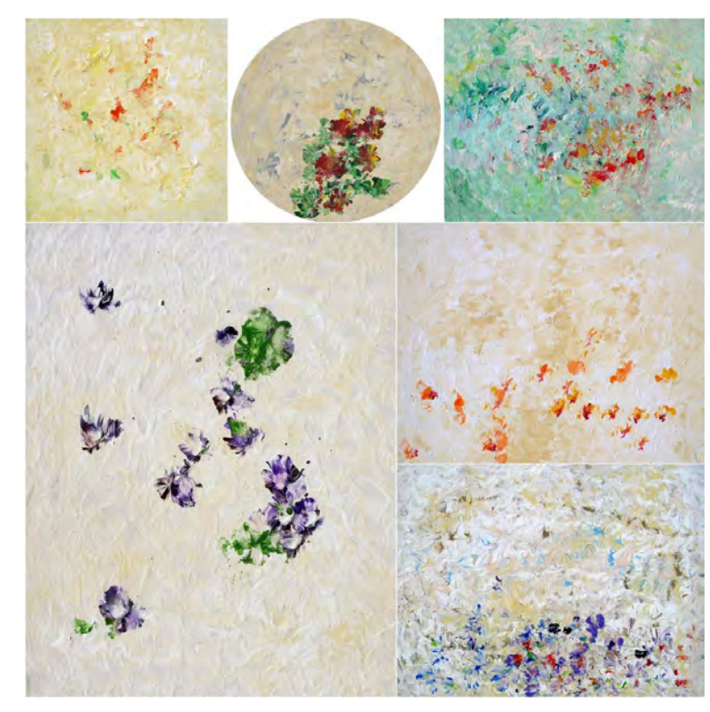
Collage of MOZART DANE's paintings.