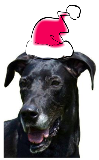
TORI is missing a leg but her heart is full of love. See her story at <a href="http://hhdane.org/danes/tori.htm">http://hhdane.org/danes/tori.htm</a>