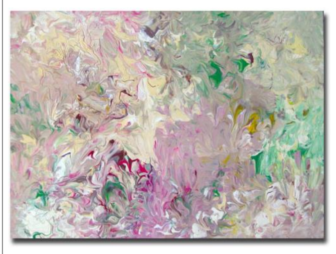
Mo's Memories of Mom by MOZART DANE. 18" x 24" acrylic on canvas, $275.

HHGDR continues to honor Mo by taking up his quest to end the abuse and neglect of dogs and puppies in puppy mills. The <u>Mozart Dane Facebook</u> page and <u>Twitter</u> account have