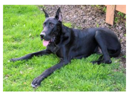
Adoptable VALENTIN rests on t he grass after a spring romp. See his story at <a href="http://hhdane.org/danes/valentin.htm">http://hhdane.org/danes/valentin.htm</a>

Attention early in the spring to the dangers of the season will reward you with many healthy and happy summer days with your pets.