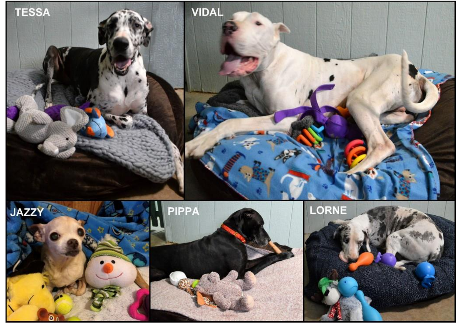
Thank you to all who made the Rescue dogs' holiday season special with toys and treats! From the tiniest to the largest, they all send hugs, slobbers, and kisses!

See their stories and how to adopt them at <a href="http://hhdane.org/danes/1danelist.htm">http://hhdane.org/danes/1danelist.htm</a>