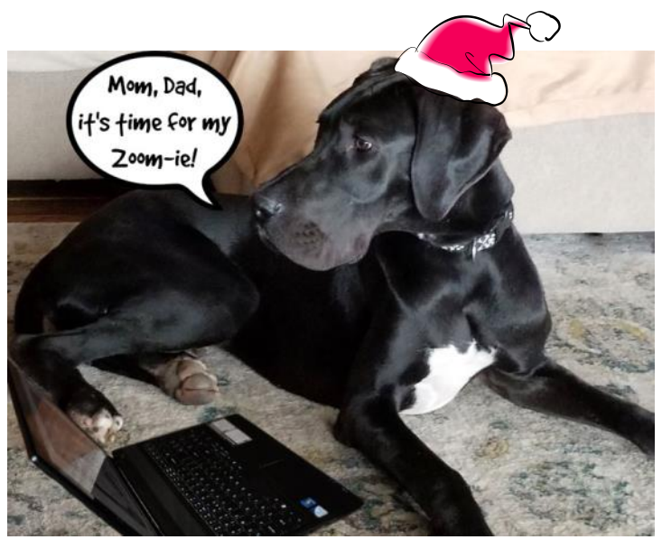
DARYL, HHGDR Sanctuary Dane, models virtual training.

dog's focus, and probably yours, is better, progress is quicker.