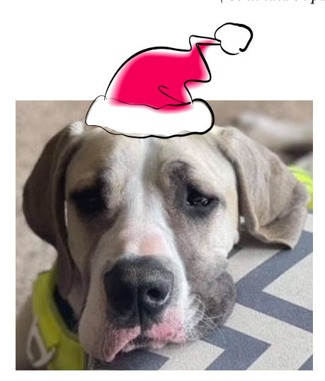
Кікі is now ready for adoption!

Her story: https://hhdane.com/danes/kiki.htm